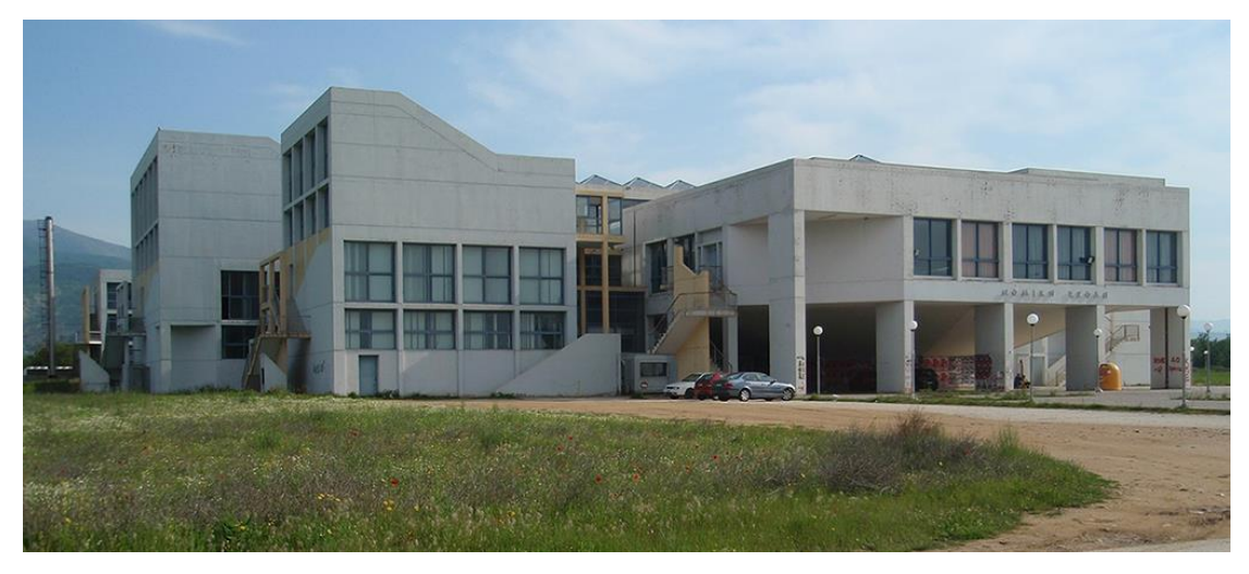
DUTH Department of Law – General view