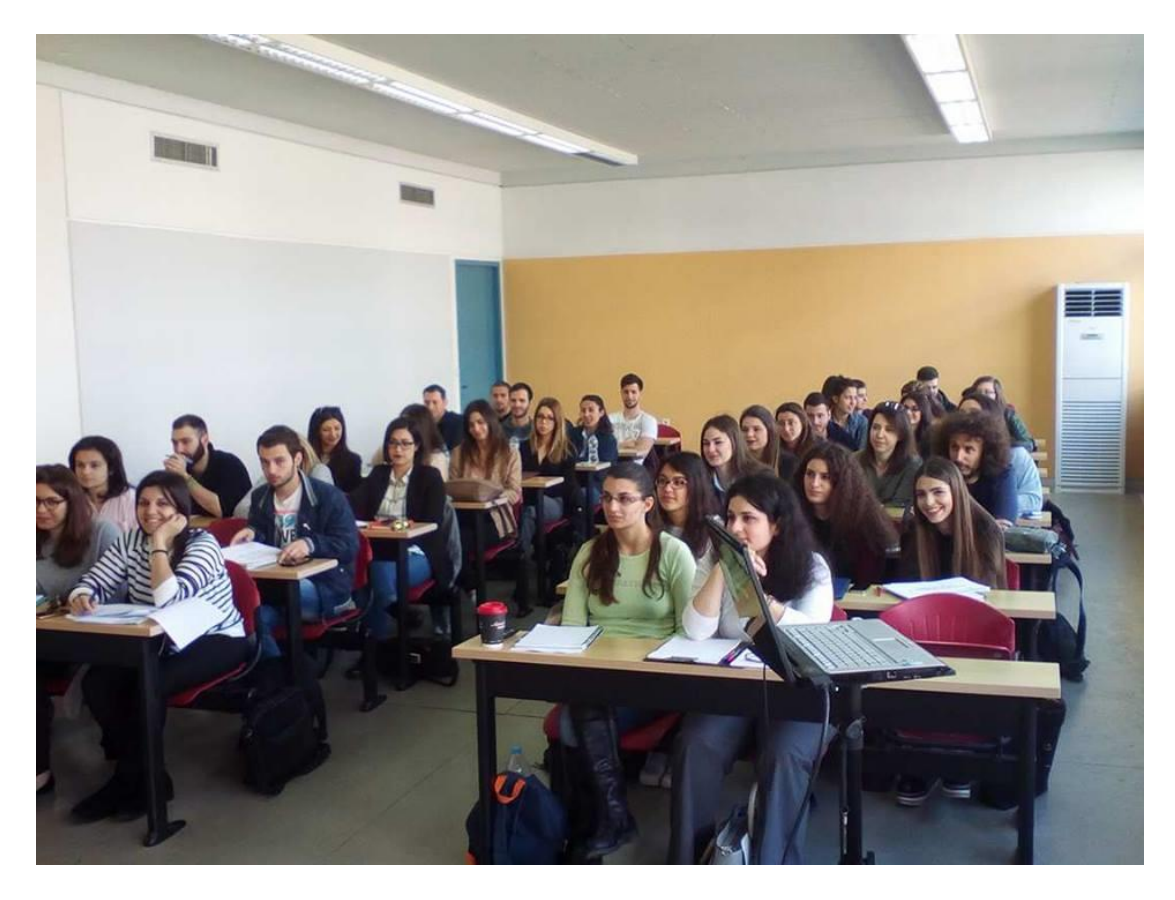
Photo of the seminar 'European Citizenship as a Fundamental Status of European Citizens'

3. Training of Trainers on European Integration on "Current Issues of European Integration", December 2019, Komotini, 20 hours. The seminar, organized in cooperation with the Europe Direct of Xanthi Information Center, was attended by secondary education teachers of Eastern Macedonia and Thrace. Despite the efforts made, there was little response from the teachers. The final number of teachers who attended and received the relevant certificate was 15.