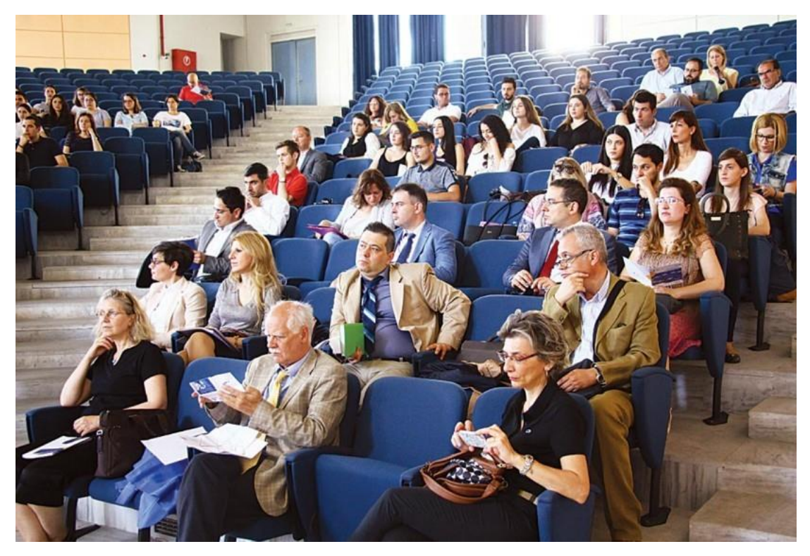
Photo from the conference "The European constitutionalism and its crisis"