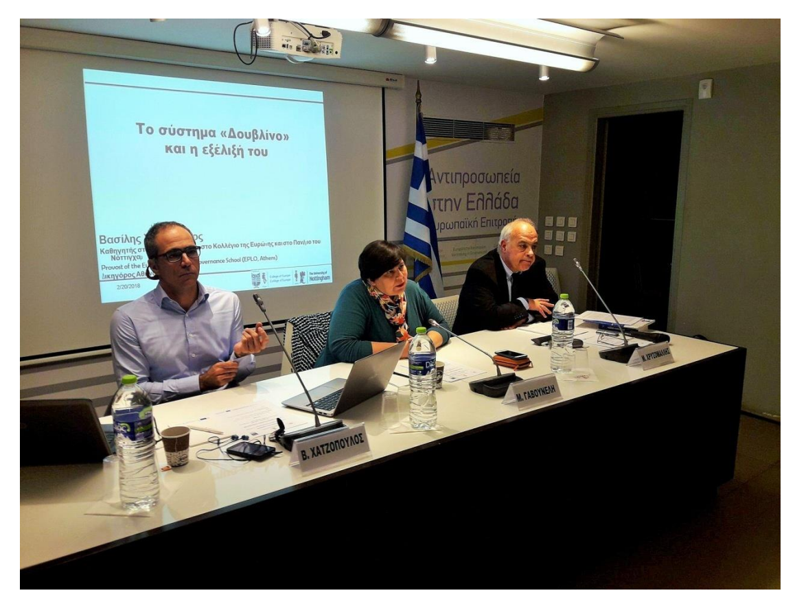
Panel in the Information Meeting 2/2018, 12/12/2018 Komotini