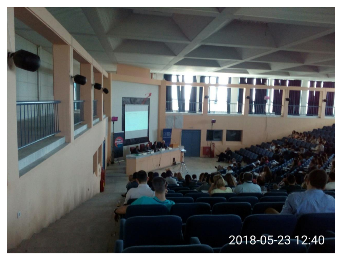
Photo from the conference "The European constitutionalism and its crisis"