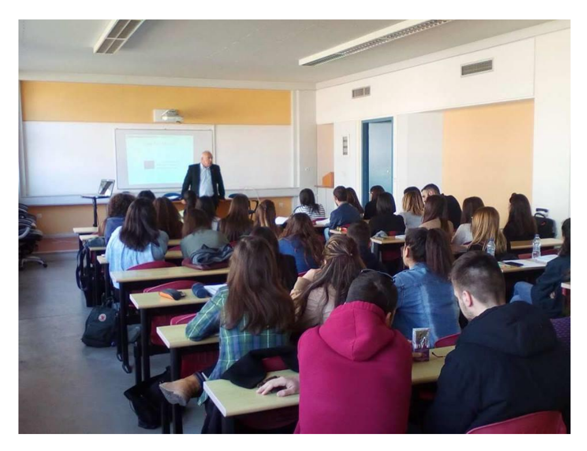
Photo of the seminar 'European Economic Governance: Democracy and Rule of Law Issues'

European Economic Governance: Democracy and Rule of Law Issues, February – April 2017, Komotini, 50 hours. Students from the Department of Law, the School of Social, Political and Economic Sciences and the Department of Social Management and Political Science of the Democritus University of Thrace participated in the seminar by invitation. The students were given a teaching material (book) of approximately 150 pages. The final number of students who attended and received the relevant certificate was 35.