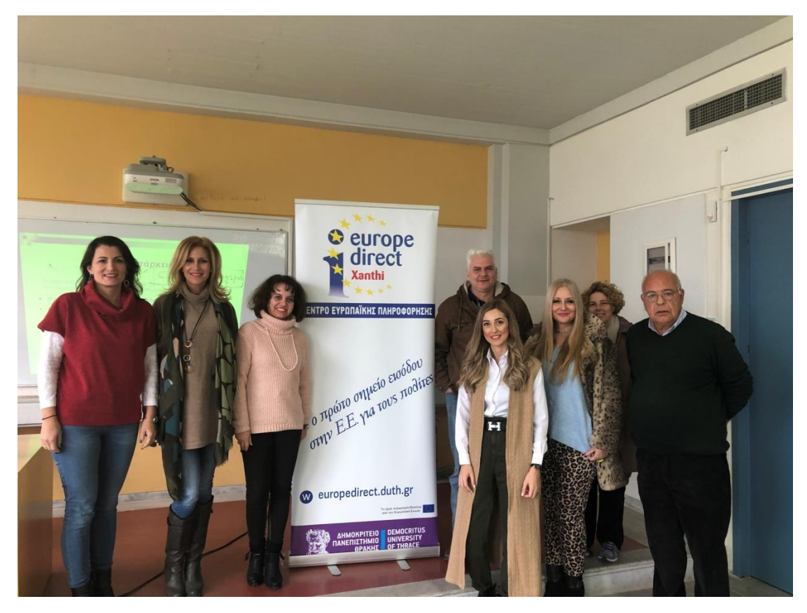
Photo of the seminar on "Training of Trainers on "Current Issues of European Integration"

The poster of the seminar on 'Training of Trainers on European Integration on "Current Issues of European Integration'