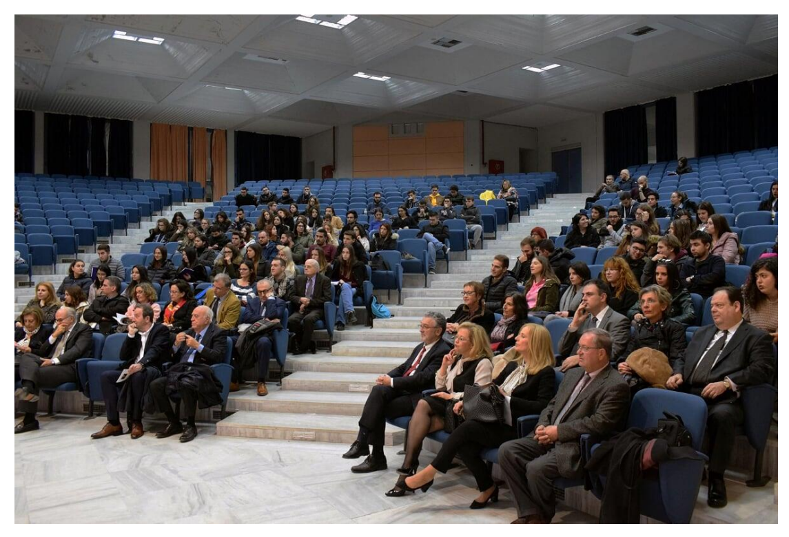
Photo of the Conference "Rule of Law in the European Union: Acquis or in quest thereof?"