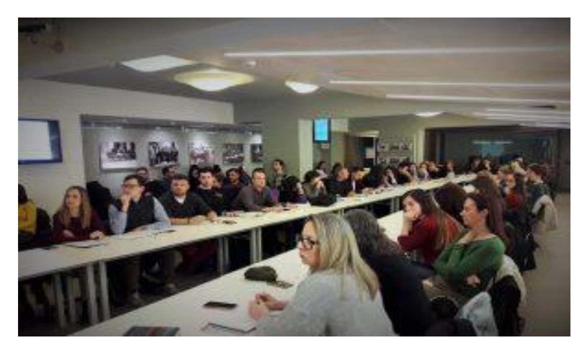
Photo of the seminar EU 'Legal Protection System and effective judicial protection of individuals' in Kavala

2. EU Legal Protection System and effective judicial protection of individuals, February -April 2018, Komotini, Kavala, 50 hours. Attorneys and Judges of the Courts of First Instance of Eastern Macedonia and Thrace were invited to attend the seminar, which was organized in collaboration with the Bar Associations (of Kavala, Drama, Xanthi, Rodopi, Alexandroupolis and Orestiada). To facilitate travel due to the distances the seminar was held in Kavala (Kavala and Drama Bar Associations) and in Komotini (Rodopi, Alexandroupolis and Orestiada Bar Associations). Participants were provided with educational material (pp, caselaw) edited by the Jean Monnet Chair. The final number of jurists who attended and received the relevant certificate was 77.